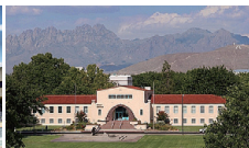
New Mexico State University