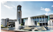
Missouri State University