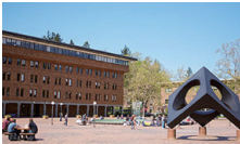
Western Washington University

These universities grant academic credit to students enrolled at them and can also grant transfer academic credit to students from other colleges who apply to the KCP program through them.