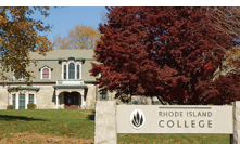
Rhode Island College