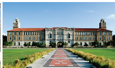
Texas Tech University