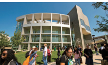
Cleveland State University

These universities grant academic credit to students who are enrolled at them.