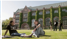
University of Idaho