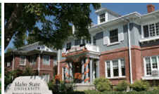
Idaho State University